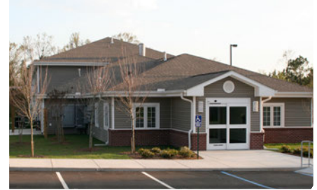
Anderson-Fischer Apartments | Mobile, AL