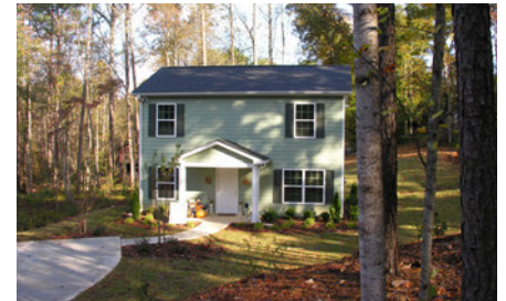
Mohawk Trail | Acworth, GA