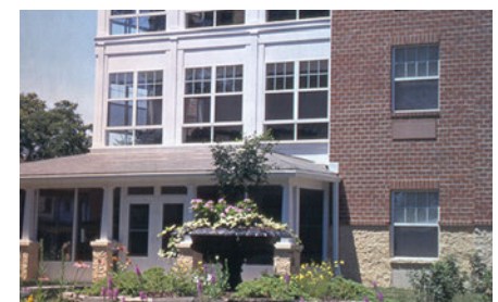
Liberty Village Senior Living | Baltimore, MD