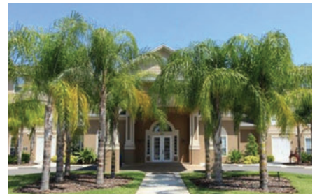
Lakeside Terrace Senior Apartments Winter Haven, FL

Rental: 56 units AHP: $490,000 Total Development: $8,887,093