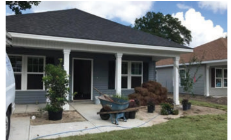
Savannah Workforce | Savannah, GA

Rental: 84 units AHP: 612,815 Total Development: $13,610,007