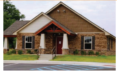
Willow Springs | Ft. Payne, AL

Rental: 56 units AHP: $490,000 Total Development: $8,887,093