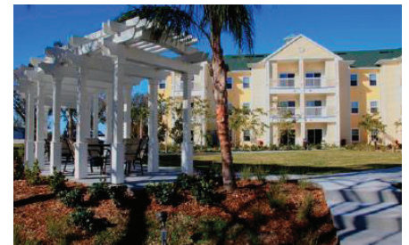
Laurel Oaks | Okeechobee, FL