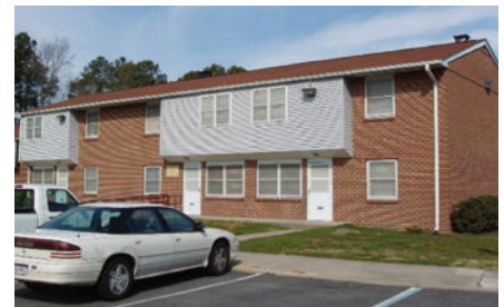
Berkley Court | Franklin, VA

Ownership: 8 units AHP: $80,000 Total Development: $1,123,223